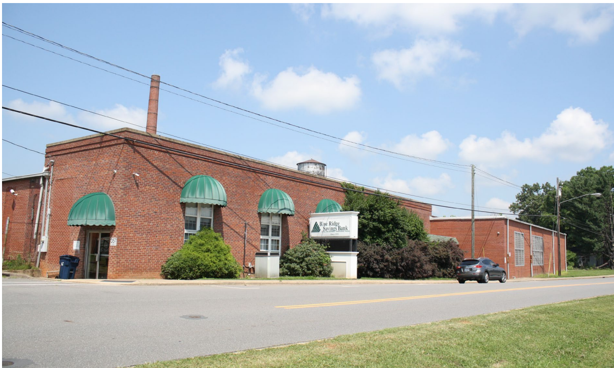
1945 Office Addition, 1965 A.C. Room, East Façade, Camera Facing Northwest