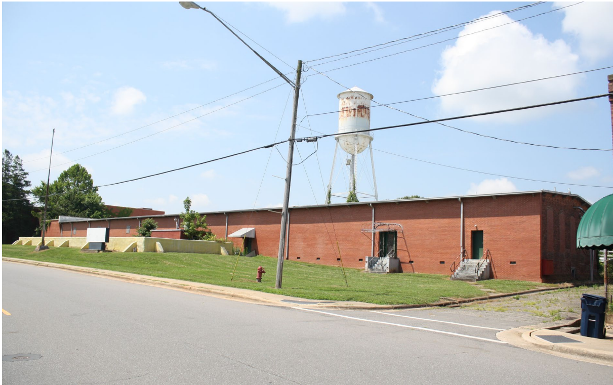
1892 Stanley Creek Cotton Mill/Lola Mill No. 1, East Façade, Camera Facing Southwest