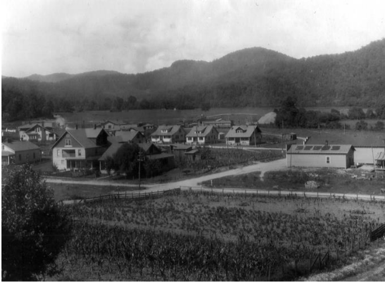
Figure 4. Atoah Street, photograph ca. 1930.

tandem with Robbinsville's population growth and is the earliest cohesive neighborhood in town. It is the most intact collection of dwellings of consistent form and style, featuring several blocks of Craftsman-style bungalows that retain triangular knee braces, exposed rafter tails, and narrow-light windows. Though covered in replacement siding, the houses at 96, 108, and 118 Atoah Street (GH0185, 0187, and 0188) retain their original scale and massing.