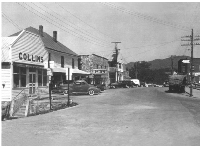
Figure 5. North Main Street, photograph ca. 1955.

New construction in Robbinsville peaked in the 1950s and 1960s, decades in which the timber industry continued to flourish. The prominence of Bemis Lumber Company as the town’s major employer greatly influenced the development of Robbinsville, giving it some of the characteristics of a company town. In addition to the circa 1930 movie theater, the lumber company provided Robbinsville with its first library, the Bemis Memorial Library, in 1938. Donations from the Bemis and Veach families replaced the original building in 1952 with a one-story, front-gabled frame