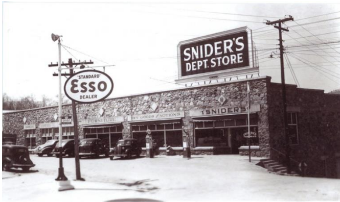
Figure 3. Snider's Department Store, undated photograph.

the building at 25 North Main Street (GH0176), constructed in 1900, is the oldest commercial building in Robbinsville and one of the few two-story buildings. The buildings at 42, 66, and 78 North Main Street (GH0143, 0140, and 0145) are more typical: modest, one-story commercial buildings for which function took precedence over decorative detail. They are single-use, purpose-built buildings having simple forms.