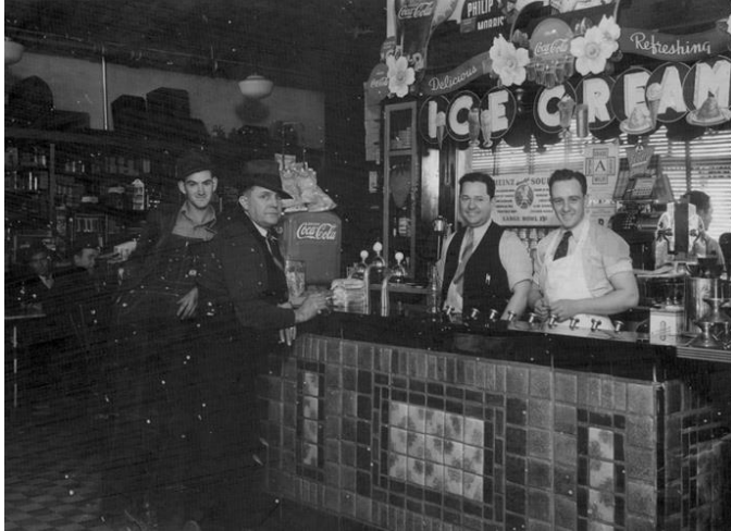
Figure 2. Ingram's Drug Store, photograph ca. 1935.

Many of the commercial buildings on North Main Street were constructed during this period. Most of these buildings are attached to one another in commercial blocks and have no setback from the sidewalks, forming a contiguous commercial corridor that radiates from the courthouse square. Two notable Main Street commercial buildings are the former Ingram's Drug Store