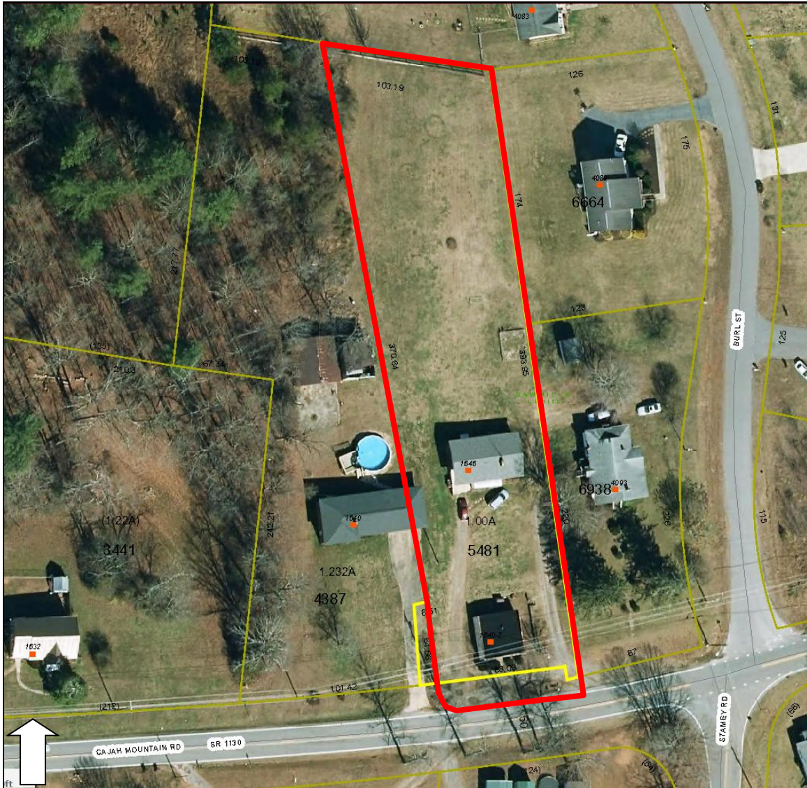
Proposed National Register Boundary for Grayson E. Annas Commercial Building and House (CW0431).

Thank you for your comments, and please contact me by phone (919-707-6075) or email ( klhusband@ncdot.gov ) if you have any additional questions or comments.