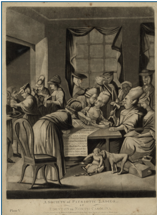
British satirists mocked women’s participation in boycotts. In this image, a non-housebroken dog licks a baby left neglected under the table. Courtesy of the Library of Congress (96511606). To access a digital copy of this image, go to https://www.loc.gov/item/96511606/ .

Nonetheless, the decision to separate from Great Britain did not come easily. Although many local governments wrote their own declarations of independence, it was clear to the Second Continental Congress that doing so created a new set of problems: fierce conflicts between the colonies about their claims to American Indian nations’ lands west of the Appalachian Mountains, a weak negotiating position with other European powers, and especially the necessity of creating new state governments. Some colonies expressly told their delegates not to vote for independence precisely because it invalidated their colonial charters.