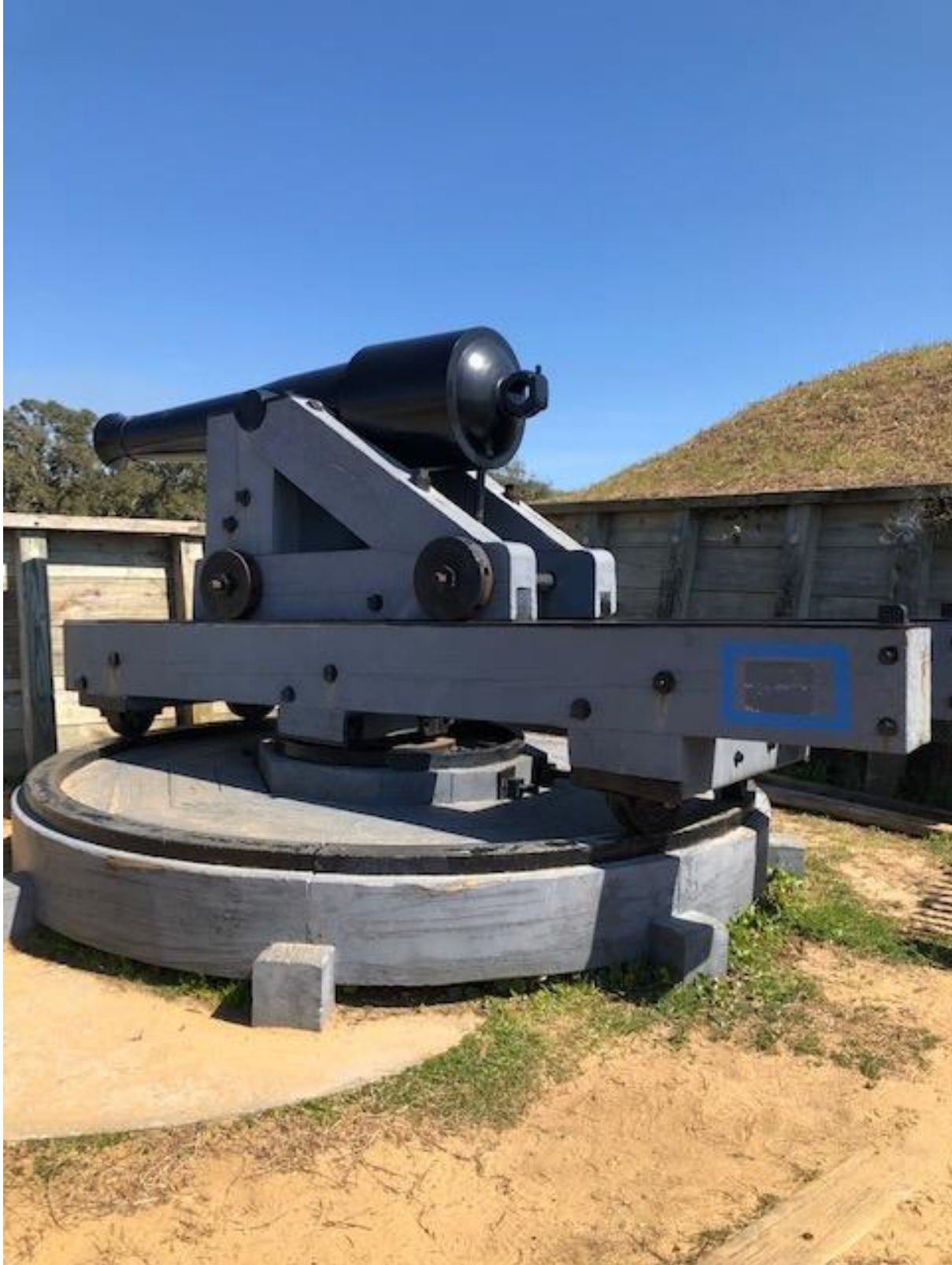
Placement of Paul Laird memorial plaque on replica 32-pounder cannon (blue tape)